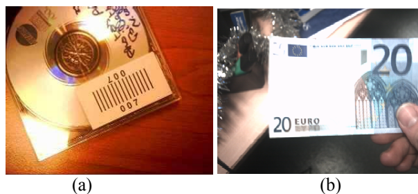
Figure 3. (a) Sample image of object recognition application (b) Sample image of euro banknotes recognition application

By using one-dimensional signals (image profiles) the system scans the image firstly vertically and then horizontally to find the right zone to apply OCR recognition. Figure 3.b shows a sample of images used in this application.