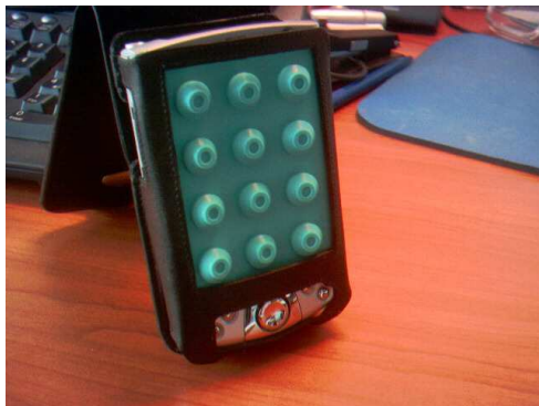
Figure 4. Prototype using the overlay

All algorithms are developed using Microsoft embedded development tools on a desktop computer and then downloaded to the pocket PC.